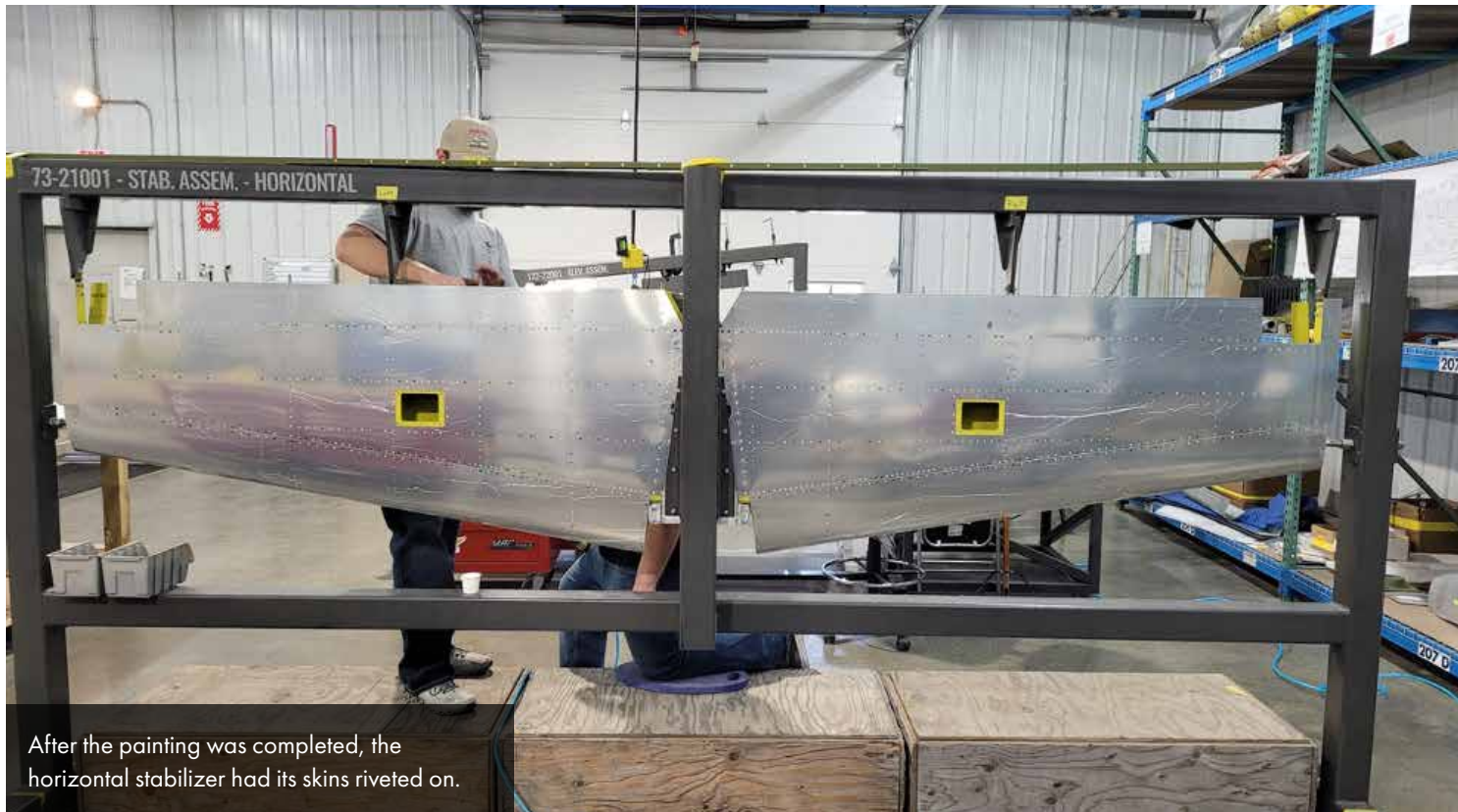
After the painting was completed, the horizontal stabilizer had its skins riveted on.