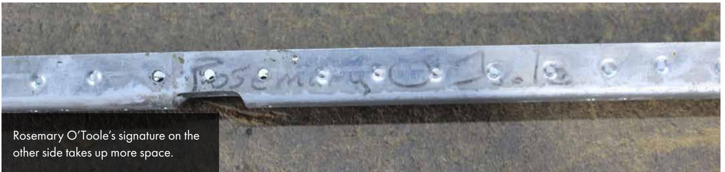
Rosemary O’Toole’s signature on the other side takes up more space.