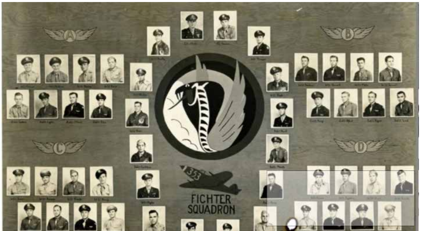
353rd Fighter Squadron pilot board. This image can be more easily examined and selectively enlarged on the 354th Fighter Group website: http://www.354thpmfg.com/history_pt1_353rdfs.html , accessed 11-9-2021

In all, the list includes twenty different pilots who climbed into Shillelagh and flew off on combat missions. Seven of those twenty pilots had attained ace status before the war ended, and four of them had double digit victory tallies.