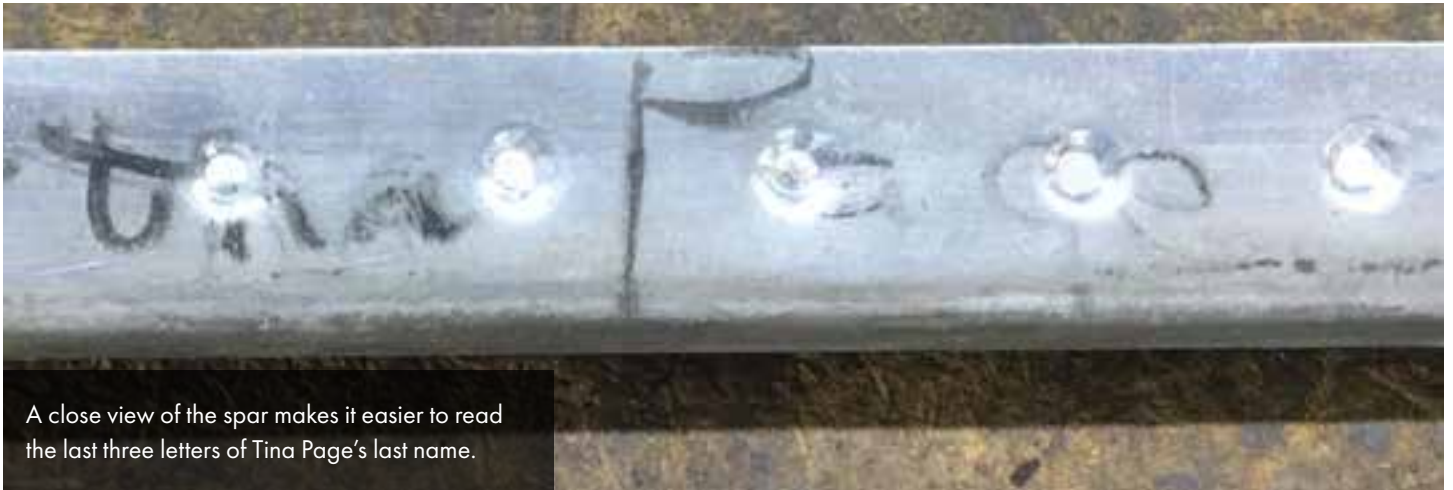
A close view of the spar makes it easier to read the last three letters of Tina Page’s last name.

Their names were Tina Page and Rosemary O’Toole. Their signatures were found on one of the spars inside the horizontal stabilizer.