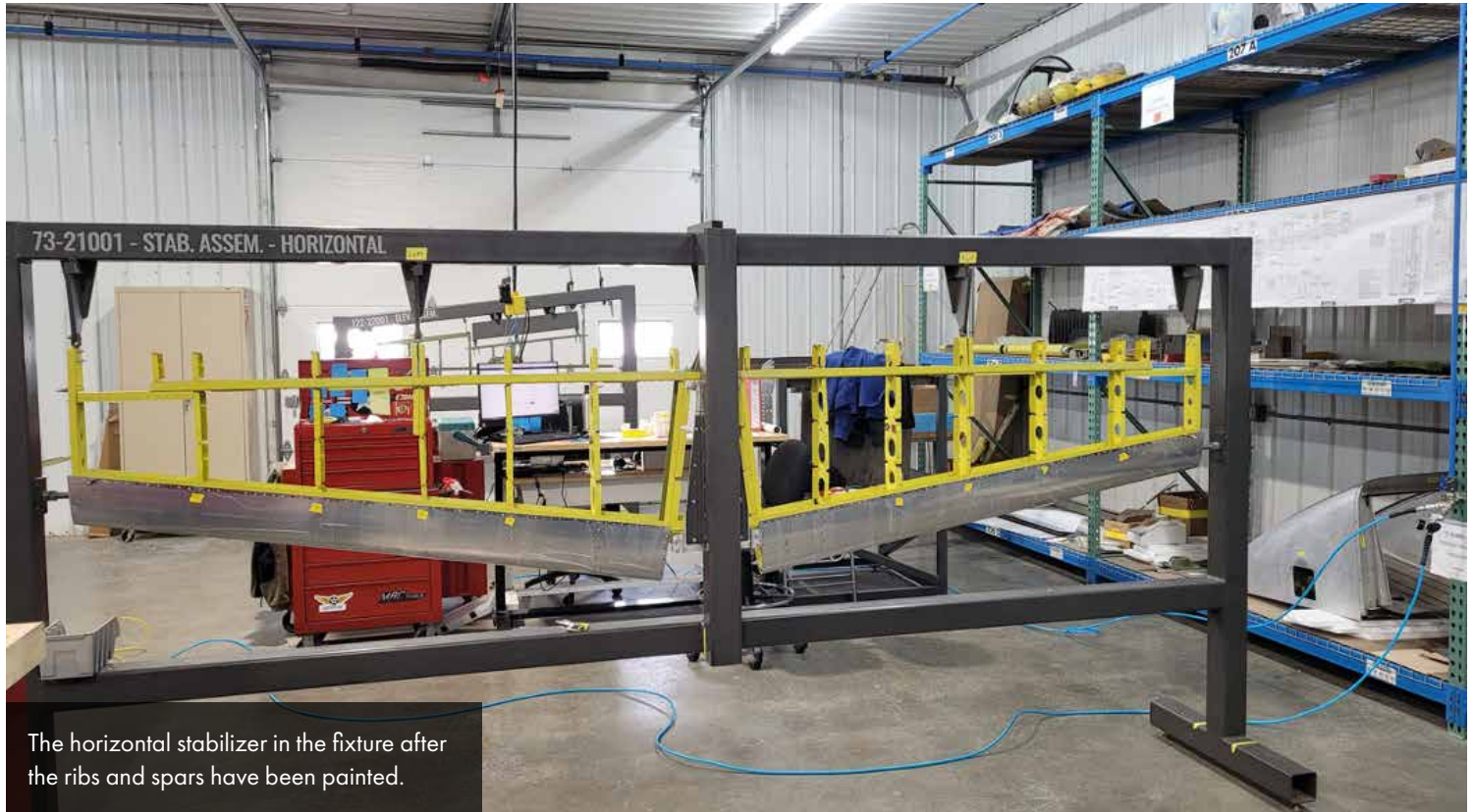
The horizontal stabilizer in the fixture after the ribs and spars have been painted.