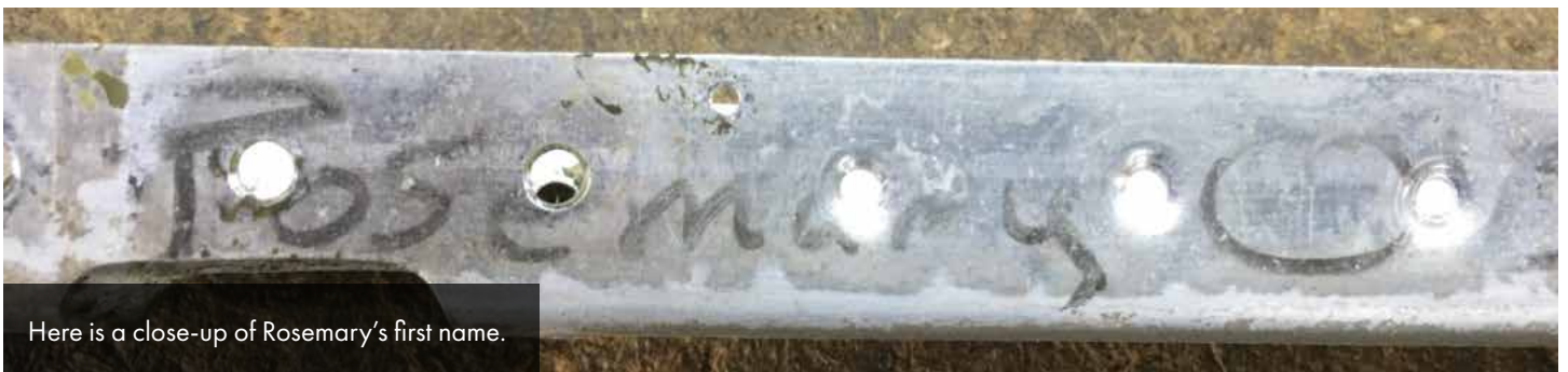
Here is a close-up of Rosemary’s first name.

Upon inspection, these spars were not found to be airworthy, but the signatures will be faithfully duplicated on the replacements.