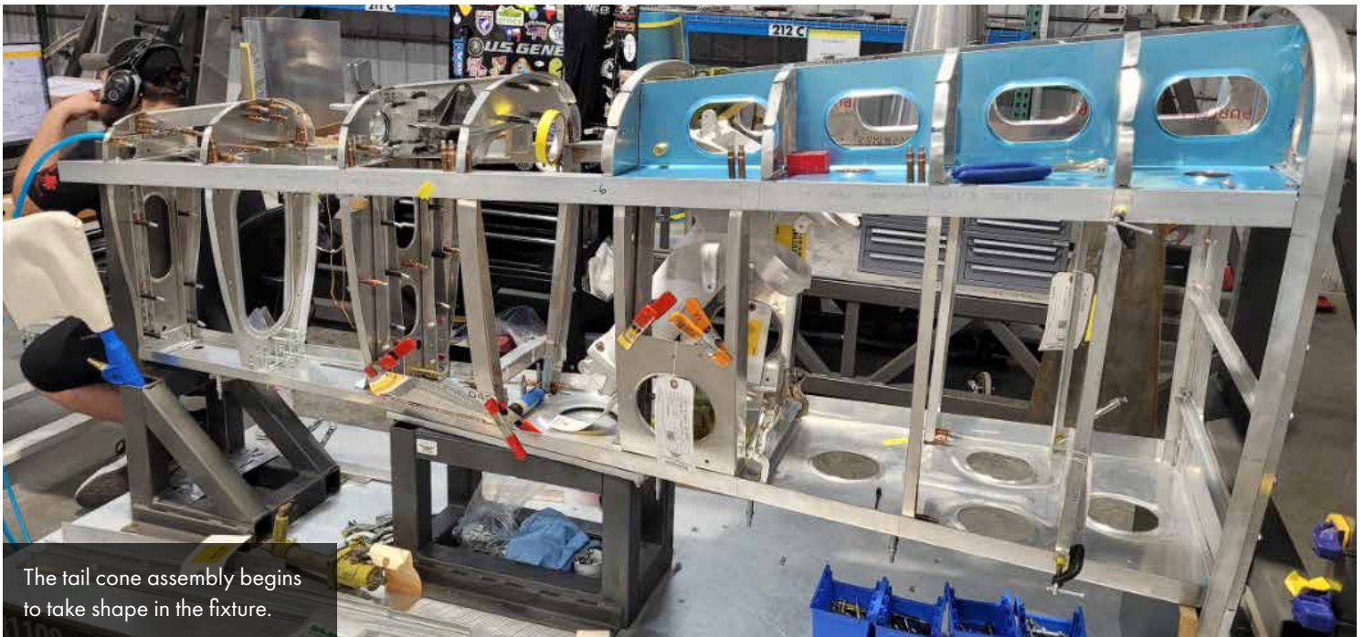
The tail cone assembly begins to take shape in the fixture.