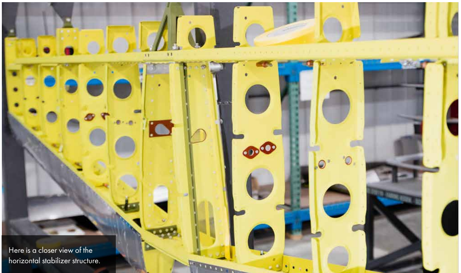
Here is a closer view of the horizontal stabilizer structure.